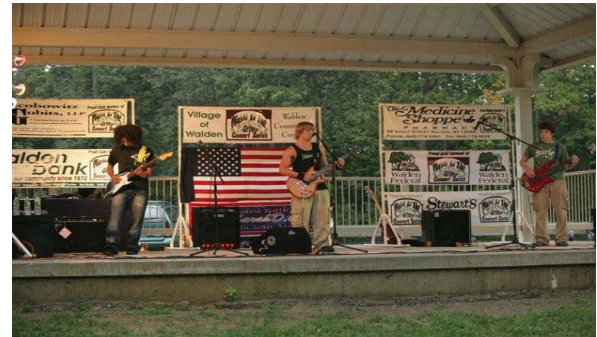
A group performs at Wooster Grove recently.

Contact the library at 778-7621 for more details.